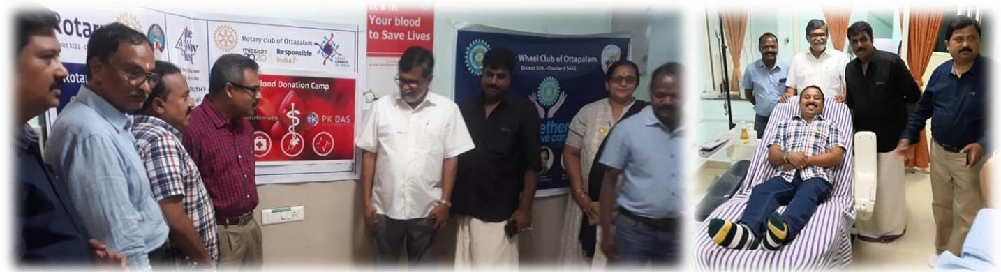
A blood donation camp was organised at PK Das Hospital.(top)