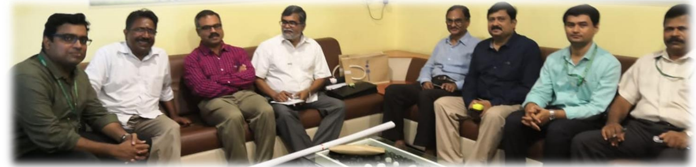
A meeting was also organised with the senior officials of PKDIMS in Planning and execution of various health projects during the year 2019-20 (below)