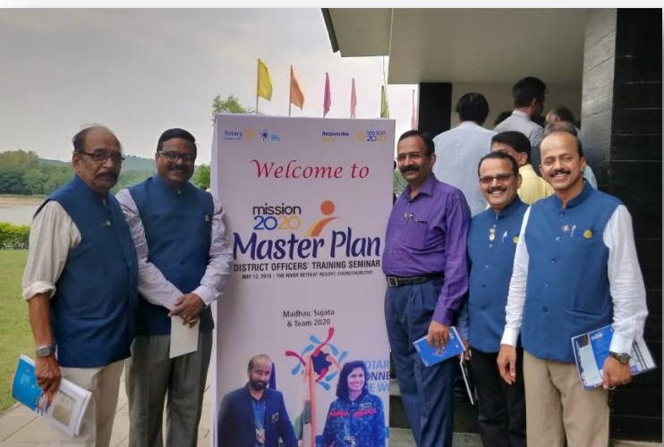
District Officers from our club got trained at DOTS