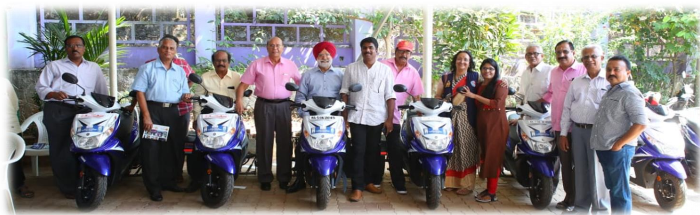
gave a new life to one quadriplegic patient with chin operated wheel chair and 25 paraplegic patients with 3 wheel scooters and special training to make various items for a livelihood. Some of the beneficiaries with Rotarians (above)