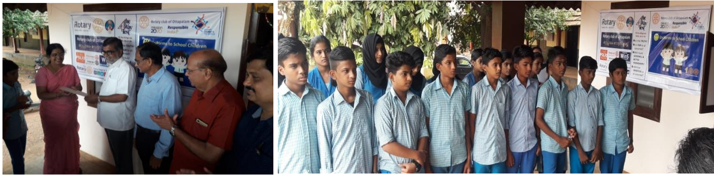
Celebrating 100 th year of Rotary in India, 100 poor children of NSS KPT High School, Ottapalam were given Uniform cloth