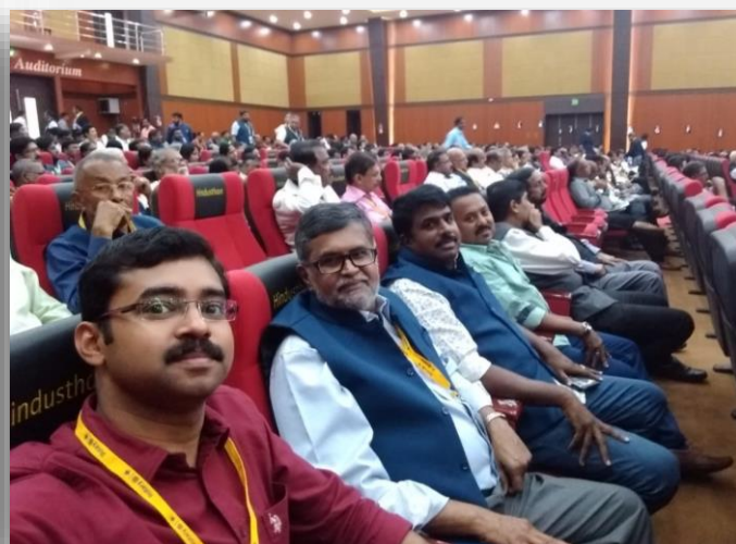
Club officers at District Assembly IGNITE