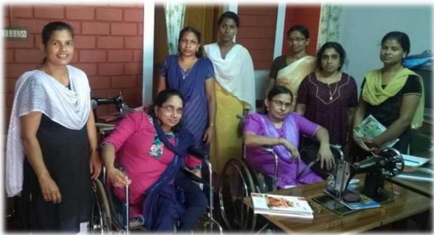
TEAM GG Training centre in full steam with several in-house training courses in progress for beneficiaries.