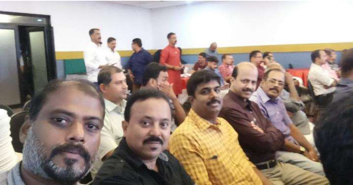
GOV of RC Olavakode on 11 th (above) RC Alathur Central on 27 th (below)