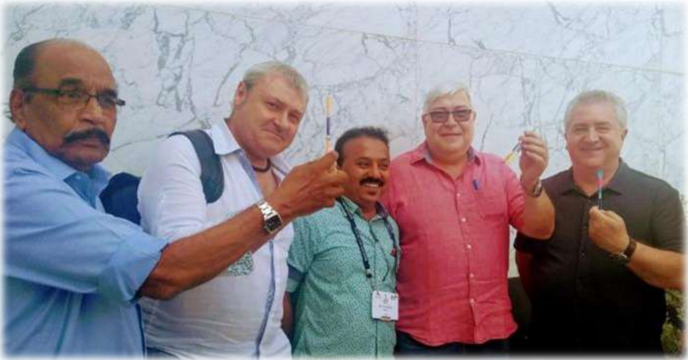
TEAM GG Training centre product, paper pens, being promoted at District Conference