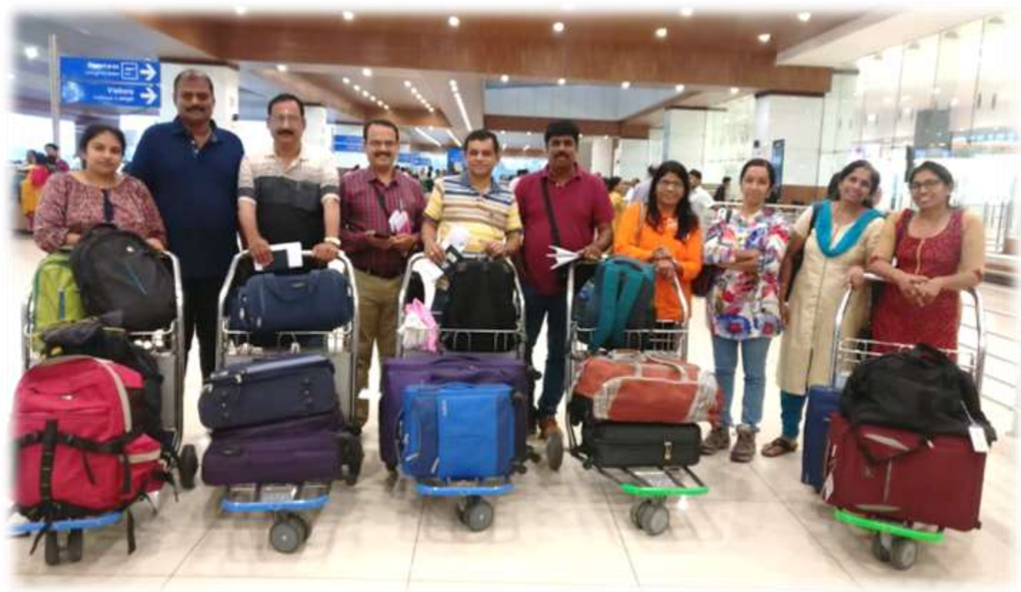
Family tour to Dubai and Bahrain from 20-26 Feb 2019 At Kochi (above) and Bahrain(below) airports