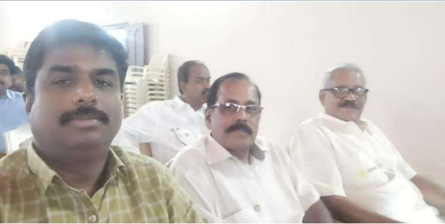
GOV of RC Vadakenchery on 2 nd (above) RC Sreekrishnapuram on 4 th (below).