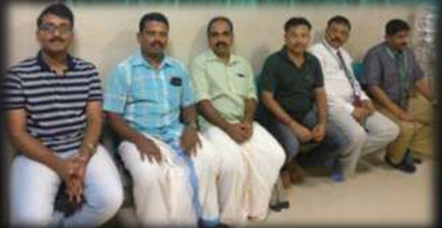
Donors waiting for their turn