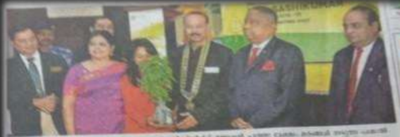
കൊച്ചിയിലെ റോട്ടറി ഇന്റർനാഷണൽ ഹാളിൽ അഞ്ച് പന്ത്രണ്ട് വർഷം നേടിയ റോട്ടറി ഇന്റർനാഷണൽ ഡിസ്ട്രിക്ട് 3201 ഗവർണർമാർക്ക് അമ്മേണു ബഹുമാനം ചെയ്യുന്നു.