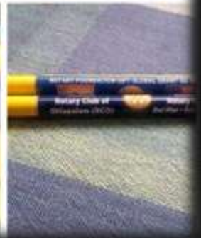
Global Grant Project: Paper pencils & LED bulbs made by recipient after training