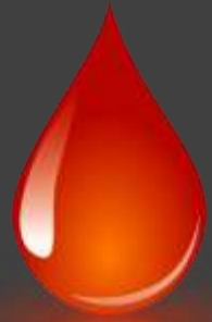
A blood donation camp was organised by RCO at PK Das Hospital on Sunday, 8 th July 2018.