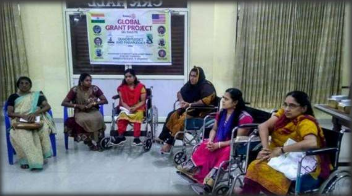
Global Grant Project: Sewing machine recipients