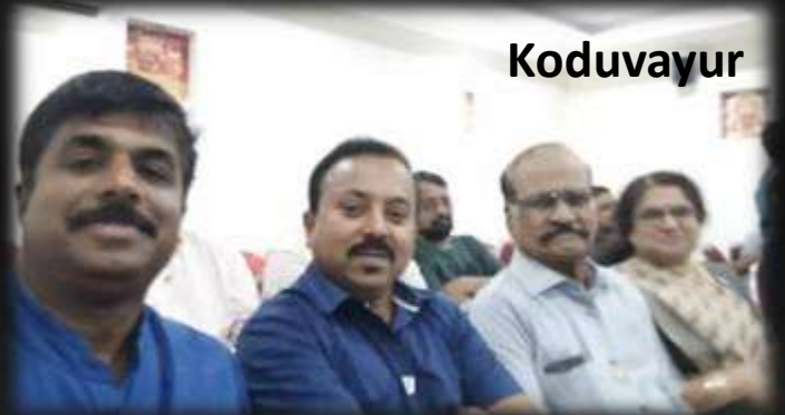
at the installation ceremony of RC Koduvayur