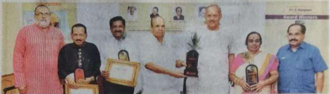
അക്ഷയ ദേശീയ അവാർഡ് മഹാദാഷ്ട മുൻഗവർണ്ണർ കെ. ശങ്കരനാരായണൻ സമ്മാനിച്ചപ്പോൾ