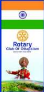
Rotary Club of Ottapalam (RCO)

Global Grant # 1861779 A joint project of Rotary clubs of Ottapalam & Del Mar-Solana Beach(USA) for supporting paraplegics & quadriplegics Inauguration on 3 rd Dec 2018