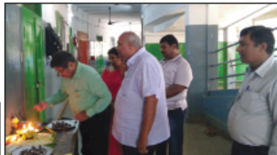
Bhoomi Puja for the Toilet Block renovation at AMS