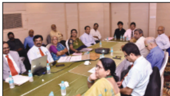
The Club Assembly held during DG visit

Later the DG presided over the Club Assembly held at Hotel Savera where he attentively listened to the Board members presenting the work done during the year and gave his valuable inputs.