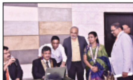
DG launching the RCMS Archives